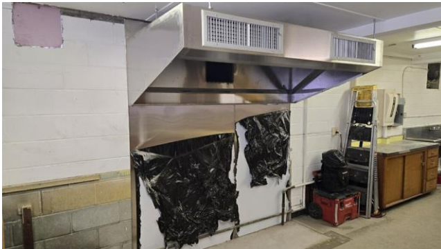
The new fire suppression hood partially installed

If you are able to give to help complete the work of the kitchen, please label your special offering “kitchen fund” and put it in the offering plate, mail it in or use the QR code in the bulletin to give your much appreciated gift.